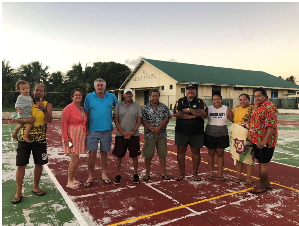
Photo: Vaipae Tennis Courts, Aitutaki, Cook Islands 2021

In the year 2021 Aitutaki and Pukapuka paid an affiliation fee of $300 each to Tennis Cook Islands. TCI sent junior rackets, some tennis balls and tennis nets to these islands.