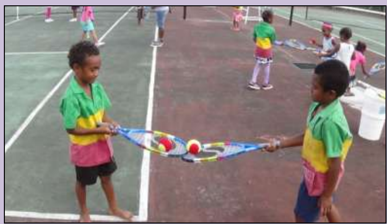
Blue band – work in cooperation

While our primary goal was to have 13 schools involved, we focused on the schools listed above in order to ensure a better quality and gain more regular players.