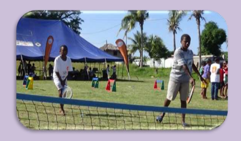
AOP PROGRAM PRESENTED AT THE OLYMPIC DAY – JUNE 2016