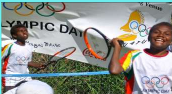
Participation to events is part of our awareness program. Above young kids try tennis during the Olympic Day at Wan Small Bag Theatre. On the right, our young JTI players taking part to the International Tennis Day

Kindy Tennis is the flagship of our Australian Open Pacific Pathway Program