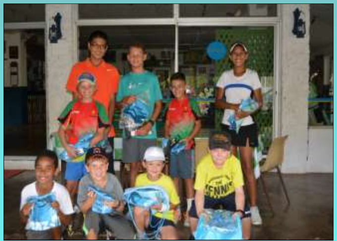
Some of the participants to the Inter-Primary/Inter-Secondary School Competition