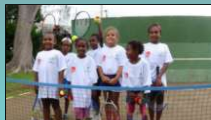
Some of the participants to the Mini-TVL all aged 6 and under.