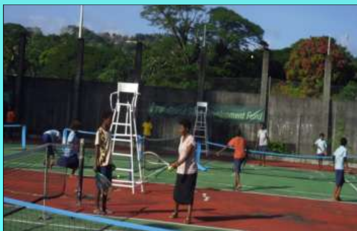
Epauto Junior Secondary Year 7 students received a 10 sessions introduction to tennis! The Hot Shots nets donated by Tennis Australia allowed us to conduct these sessions with big group and to keep the kids very active...

The TVL U16 Regional Championships record a huge increase in regional participation.