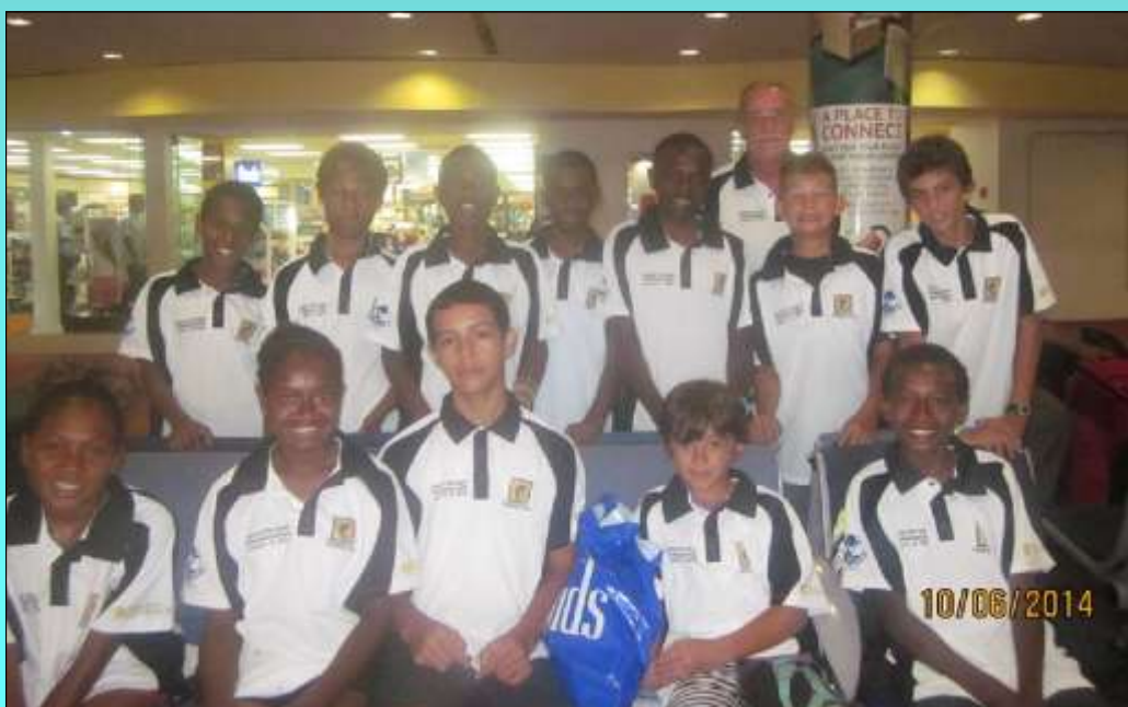
The Junior Team on their return from the Fiji Open