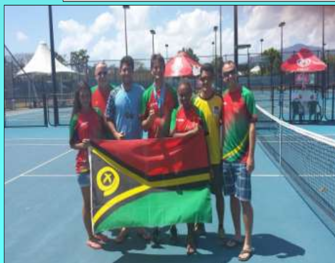
The Oceania 2014 Team in Cairns!