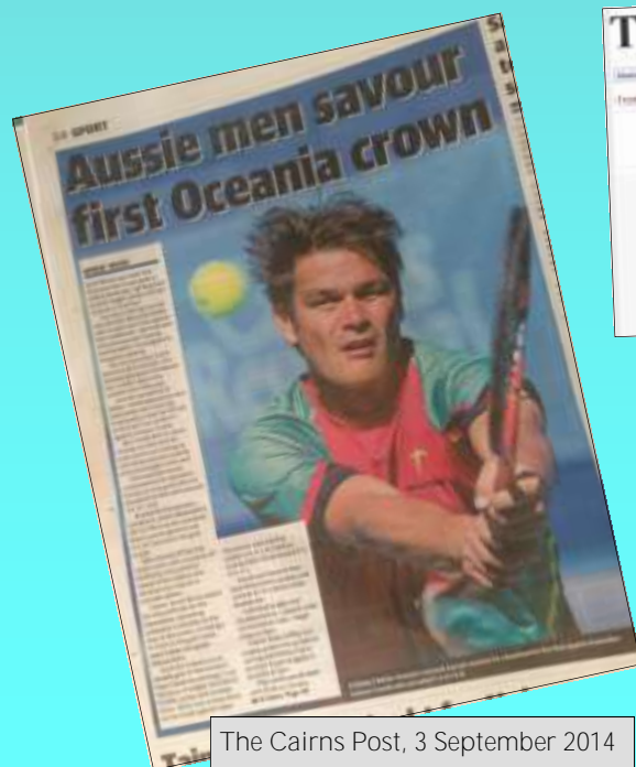
The Cairns Post, 3 September 2014